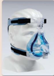
Respironics Comfort Gel