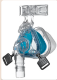
Respironics Comfort Gel