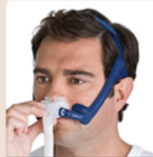
ResMed Swift LT